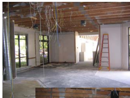
Left: The second student commons area

We will have an open house once the building is ready—stay tuned for details! In the meantime, you can check our website for periodically updated pictures of construction progress.