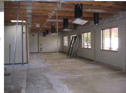
Right: One of the four new classrooms