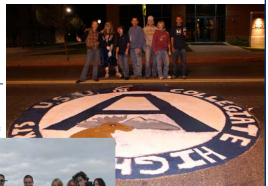
Top: Art Club participants with their street painting