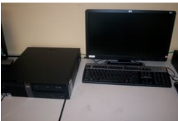
New Eng. Computer

Each year, ICBS receives funding for its CTE programs. This year, these CTE funds were used to (among other things) replace the engineering computer lab with faster, beefier machines. An additional donated computer lab (from the Internal Revenue Service) has made it possible for InTech to have 2 open access and 2 dedicated computer labs and improve our computer to students ratio to 1:1.25.